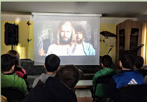
The Jesus Film in Romanian