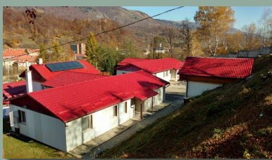
The Family Center